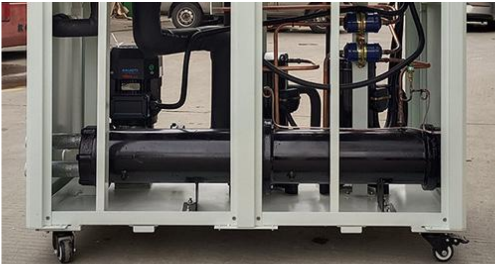
Shell and tube Condenser for water-cooled Printing chiller

The condenser for water-cooled Printing cooler is shell and tube ,with the internal copper tubes employing an outer thread embossing process.This design effectively enhances the heat exchange efficiency between the refrigerant and water during the process. Compared to traditional smooth copper tubes, the outer thread embossing process increases the surface area of the copper tubes, thereby expanding the contact area for heat exchange and improving the thermal conductivity of the condenser. This optimization design allows the condenser of the water-cooled chiller to transfer heat from the refrigerant to the water more rapidly and consistently, enabling the water to carry away the heat.