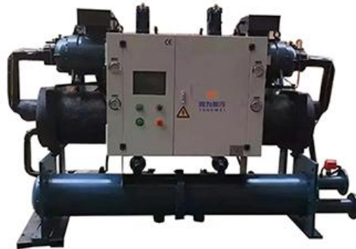
Water-cooled Printing Screw Chiller