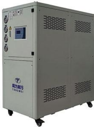
Water-cooled Printing Scroll Chiller