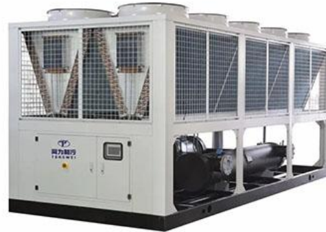
Air-cooled Printing Screw Chiller