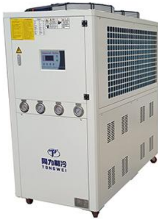
Air-cooled Printing Scroll Chiller