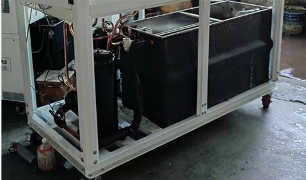
Coil in SS Water Tank Evaporator

The evaporator is a crucial component of air-cooled water chiller, as it is responsible for extracting heat from the liquid being cooled, it is located between the compressor and the expansion valve. There are three types of evaporators : coil in water tank evaporator , shell and tube evaporator , 304SS stainless steel plate type evaporator .